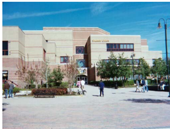
Student Union, University of Central Florida 2003 Annual Meeting Venue