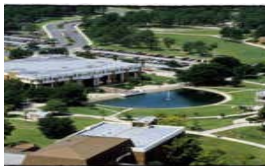
University of Central Florida